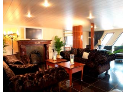
The comfortable and inviting lobby resembles a 5 star luxury hotel and provides comfy chairs, wide screen TV and Dolby sound system.