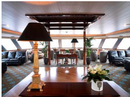
The Living Room. Relax, sightsee, slumber or join us for coffee and tea service.