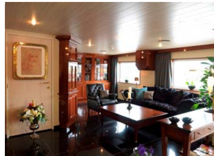
Indulge in the grand collection of English books while you sip on a cappuccino in the library, any time of day.