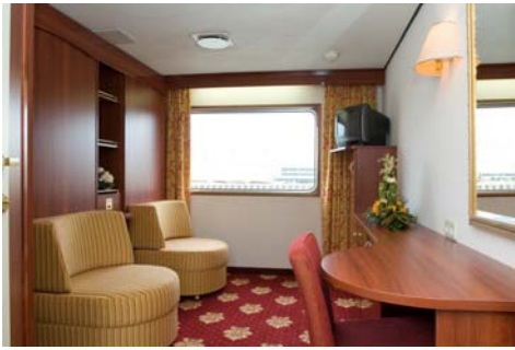
Our comfortable guest cabins provide more usable space than most other vessels. Wide open spaces and lots of storage.