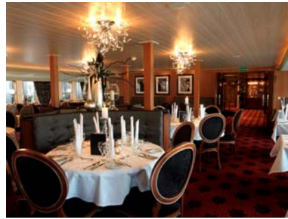
Our Dining Room offers one sitting, open seating dining. The entire vessel is 100% smoke free, including the outside decks.