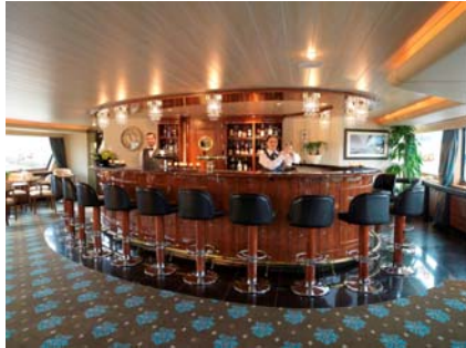
The Bar serves a dramatic blend of cocktails, world class wines, beers and spirits.